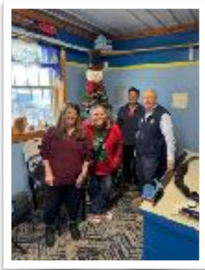
Teachers of the sight impaired children (above left) attended event hosted by the Churchville Lions (above right)