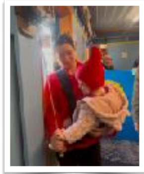
Sight impaired children of all ages enjoyed the interactive features of the train garden.