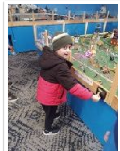
Whether playing with the old trains in the hands-on display, operating a train controller, or pushing buttons to activate 1 of the display’s 21 motion & lighting features, the kids had fun!