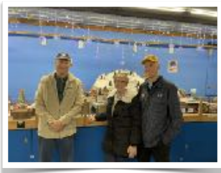
Lions from several Harford County clubs including the Aberdeen Lions (above left) and Bel Air Lions (above right) hosted guests at the train garden during the holiday season.