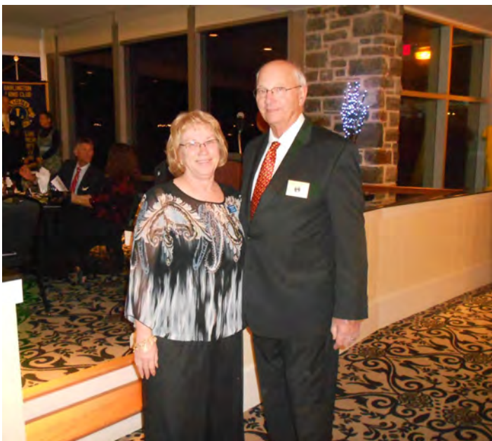
One of three tables for the DLC members and guests.