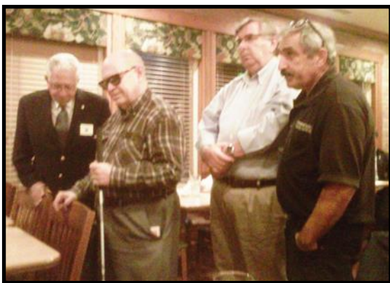
Pictured are new Overlea Lions Club members and sponsors — listed on page 7.

In October, the Overlea Lions helped sell shopping passes to the Boscov's Friends helping Friends event. Our club received $5.00 for each pass sold.