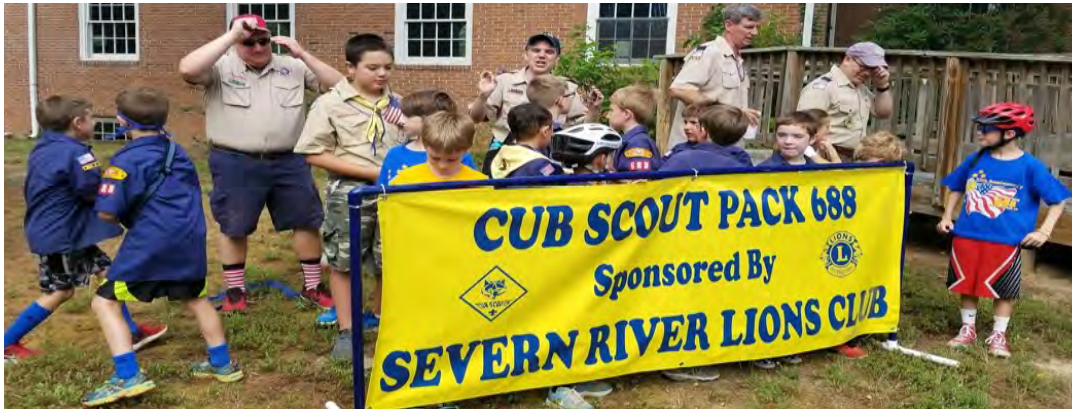
Cub Scout Pack 688 trying to get organized for a photo op.

District 22A Club News and Views Newsletter 2017– 2018