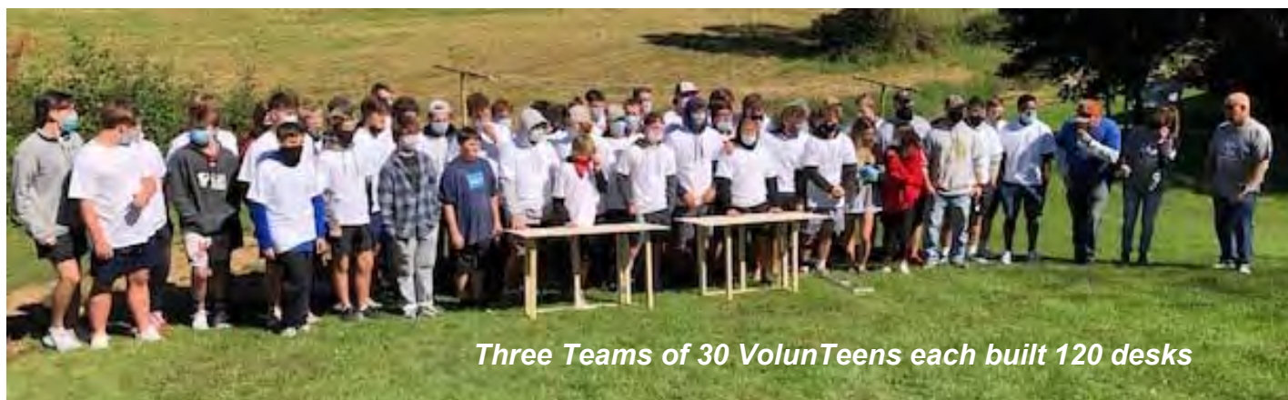
Three Teams of 30 VolunTeens each built 120 desks

The VolunTeen Leo Club and Bel Air Lions partnered to build and deliver 120 desks for kids to have a dedicated workspace at home at the beginning of school. Several other organizations contributed and some individuals “sponsored” desks to help pay the costs.