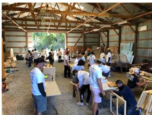
Desks being constructed.