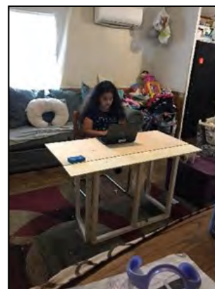
Recipient of a desk working at home