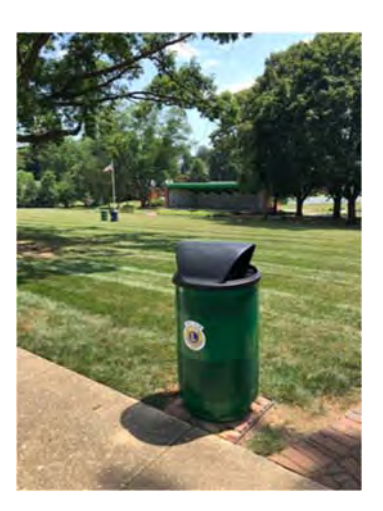
Keeping Shamrock Park Clean!

The Bel Air Lions donated 6 new trash receptacles for the Shamrock Park in Bel Air.