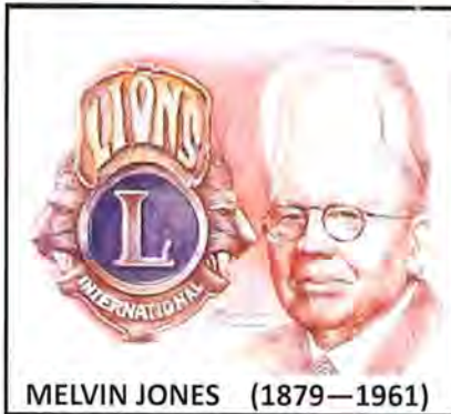
MELVIN JONES (1879—1961)

Melvin was born on a Calvary outpost in Camp Thomas, Arizona on January 13, 1879. At age 33, Melvin, after schooling at the Union Business and Chaddock Colleges of Quincy, Illinois, was sole owner of an insurance company and became a member of the local business circle. In 1917, after pursuing the thought that he and other influential businessmen, could be better utilized their talents in other areas of community life, they formed what is now known as LIONS CLUBS INTERNATIONAL , with 20 delegates representing 27 clubs from around the United States. The Association became International in 1920, when the Lions of Detroit chartered the Windsor Ontario Lions club in Canada. In 1950, Melvin Jones was conferred to title of SECRETARY GENERAL of LIONS INTERNATIONAL for life. Since that time Lions organization have grown to over 1.4 million members in over 47,000 clubs in over 200 countries. Lionism's dedication to aiding the blind grew out of a speech by Helen Keller in 1925, when she challenged the Lions to become her "knights of the blind in the crusade against darkness". In today's