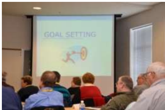
Saturday, October 21, 2017

LCI approved courses presented at the Knefely Gymnasium at the Maryland School for the Blind 3501 Taylor Avenue Baltimore, MD 21236